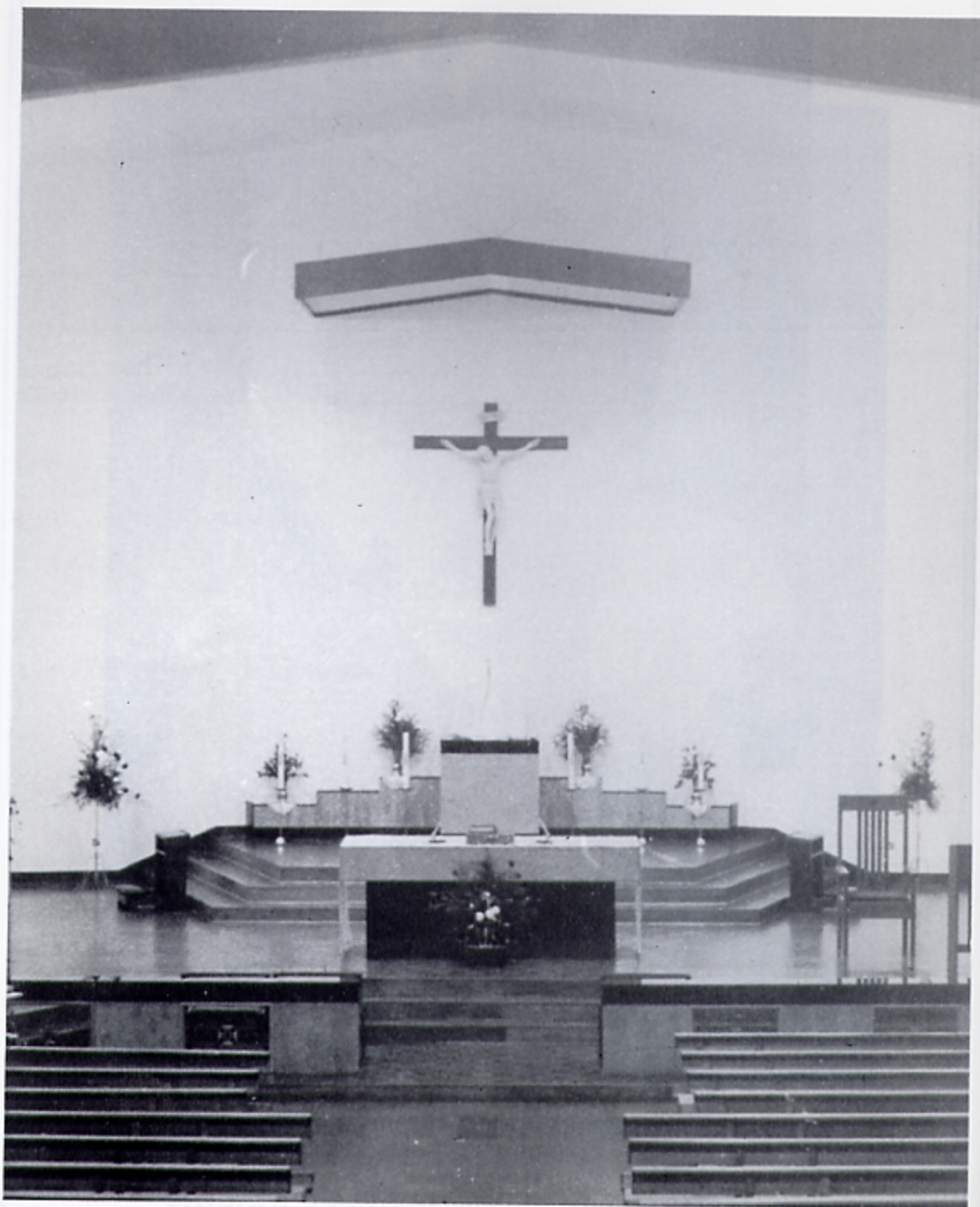
Sanctuary of First Church 14th February, 1986